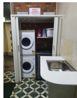
New Laundry Service available at MUNCH