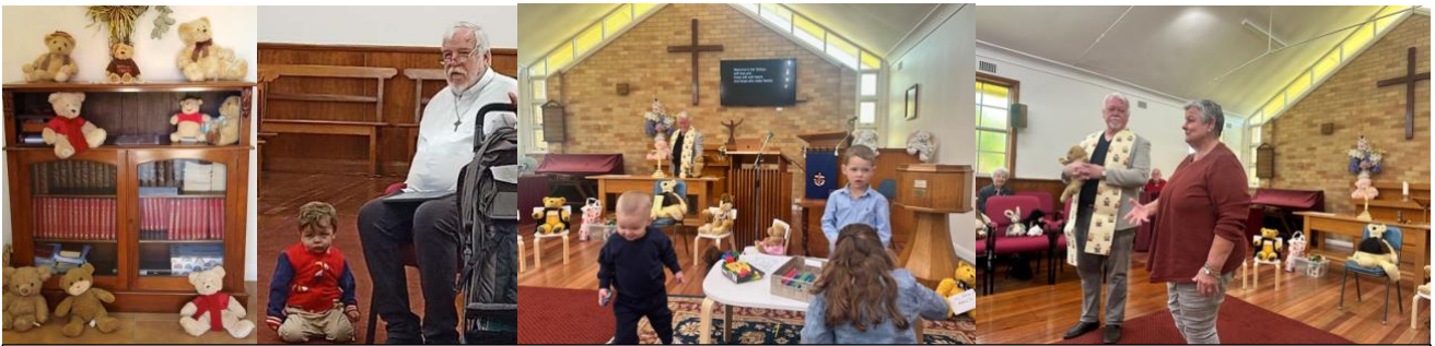
Some pictures from the Family Teddy Bear Service held on 29 September at Bolwarra.